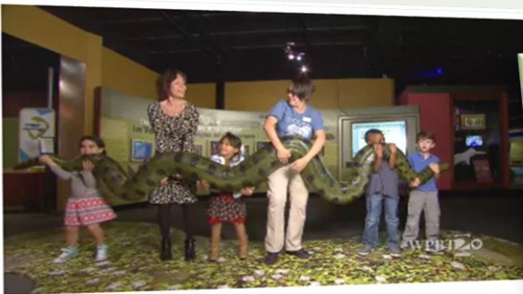
Amazon River Exhibit